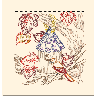
Bird_house_blocks_09-6x10.dst 6.25x6.00 inches; 17,117 stitches 10 thread changes; 10 colors